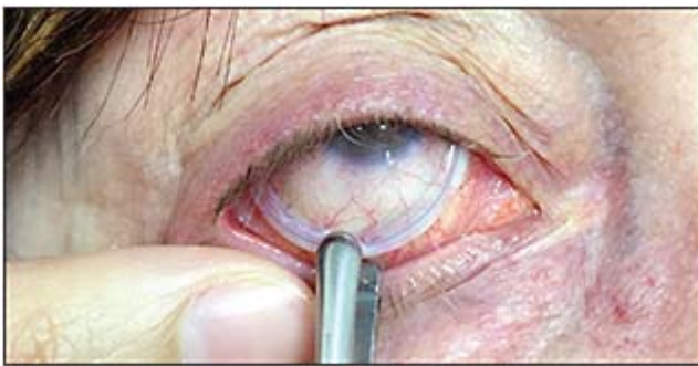
Figure 2. Prokera removal.

ProKera is FDA-approved to remain on the eye for a maximum of eight weeks after application, until the ocular surface has healed or the tissue has dissolved (Park et al, 2008; Groves, 2014). However, healing is typically complete between one and two weeks, and ProKera subsequently can be removed using blunt, sterile forceps ( Figure 2 ). Commonly, the ProKera membrane is totally absorbed by the cornea in less than a week, at which time the plastic ring may be removed and discarded.